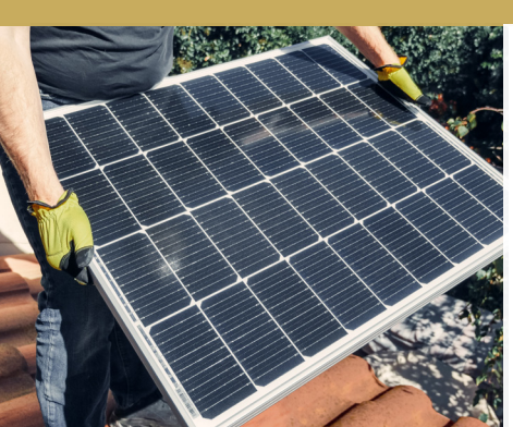
ANALYZED U.S. residential solar adopters